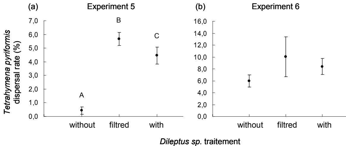
Figure 2. Tetrahymena pyriformis detects Dileptus sp. presence through chemical cues (mean \pm 1 SE). (a) Low initial density of T. pyriformis ; (b) high initial density of T. pyriformis . Letters indicate significant differences in dispersal rate among treatments.

pyriformis dispersal rate were marginally significant (Fig. 2b; F = 3.623 , d.f. = 9, P = 0.070 ). Tukey's post hoc test shows that the prey dispersal rate in the treatment «filtered» was marginally higher than in the treatment «without» ( P = 0.060 ).